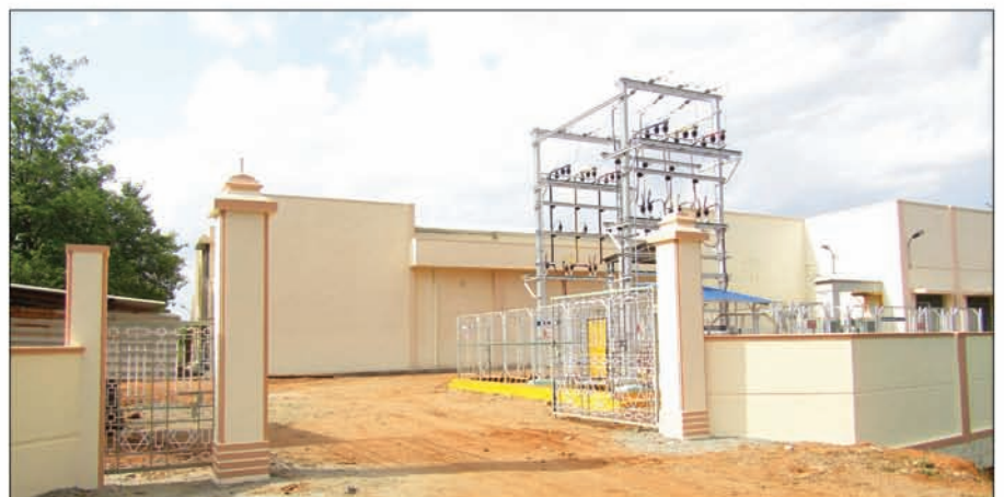
Newly constructed TFO Hall located at Subramaniyapuram Unit, Srivilliputtur Taluk